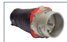
Male Inlet with Handle (Plug) 37-98043 + 65-9A013-D25

A typical order should include an inlet part number, a receptacle part number AND the matching handles, angles or other required accessories.